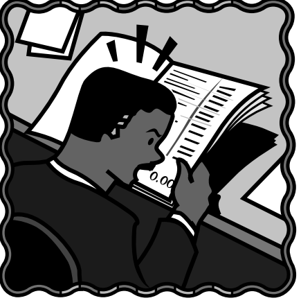
(Continued on page 4)

NO RENEWALS WILL BE ACCEPTED UNLESS THEY ARE FILLED OUT COM-PLETELY AND SIGNED BY THE LICENSEE. Make sure your check or credit card information is enclosed, filled out properly, legible, and in the correct amount. If active, do not forget about the errors & omissions insurance and continuing education.